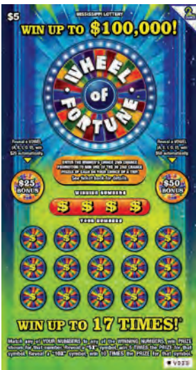
Name: Wheel of Fortune Price Point: $5 Overall Odds: 4.18 Game #: 87