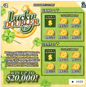
Name: LUCKY DOUBLER Price Point: $2 Overall Odds: 4.47 Game #: 194