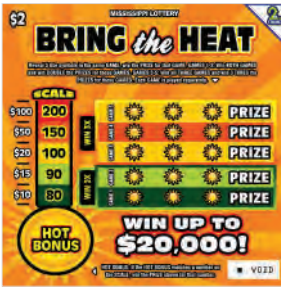
Name: BRING THE HEAT Price Point: $2 Overall Odds: 4.73 Game #: 172