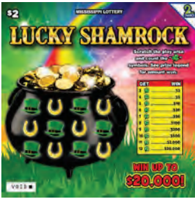
Name: Lucky Shamrock Price Point: $2 Overall Odds: 4.66 Game #: 85