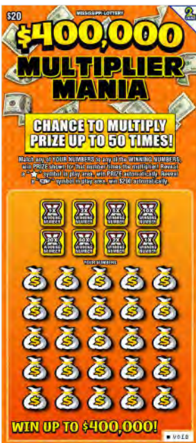
Name: $400,000 Multiplier Mania Price Point: $20 Overall Odds: 3.96 Game #: 108