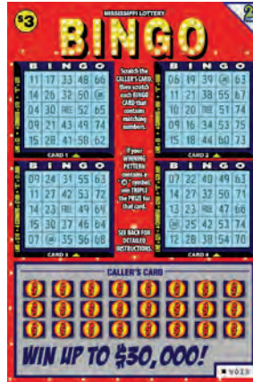
Name: Bingo Price Point: $3 Overall Odds: 4.09 Game #: 80