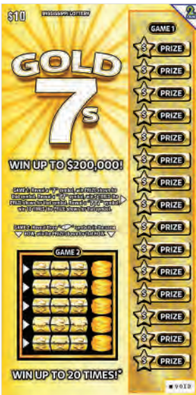
Name: Gold 7s Price Point: $10 Overall Odds: 3.94 Game #: 143