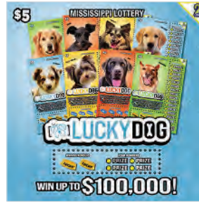
Name: LUCKY DOG Price Point: $5 Overall Odds: 4.03 Game #: 173