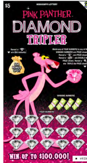
Name: PINK PANTHER™ DIAMOND TRIPLER Price Point: $5 Overall Odds: 4.26 Game #: 195