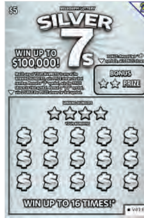
Name: Silver 7s Price Point: $5 Overall Odds: 4.21 Game #: 142