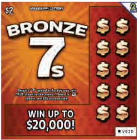
Name: Bronze 7s Price Point: $2 Overall Odds: 4.88 Game #: 141