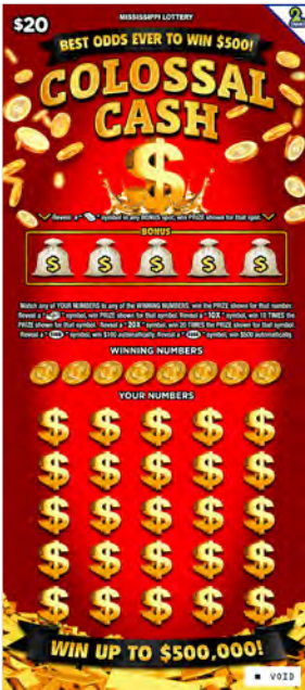
Name: COLOSSAL CASH Price Point: $20 Overall Odds: 3.50 Game #: 196