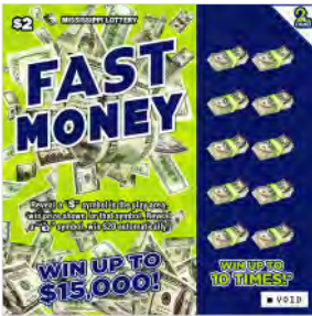
Name: Fast Money Price Point: $2 Overall Odds: 4.75 Game #: 109