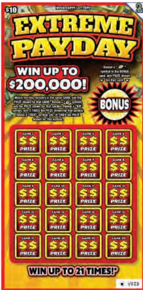
Name: EXTREME PAYDAY Price Point: $10 Overall Odds: 4.18 Game #: 174