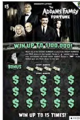
Name: The Addams Family Fortune Price Point: $5 Overall Odds: 4.03 Game #: 110