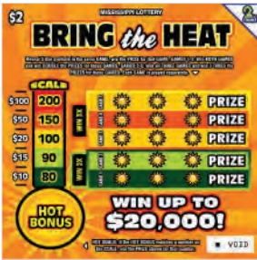
Name: BRING THE HEAT Price Point: $2 Overall Odds: 4.73 Game #: 172