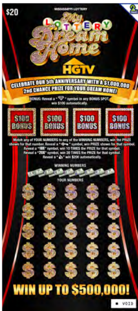
Name: MY LOTTERY DREAM HOME Price Point: $20 Overall Odds: 3.46 Game #: 189