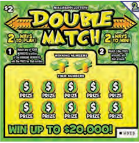
Name: DOUBLE MATCH Price Point: $2 Overall Odds: 4.50 Game #: 144