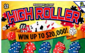
Name: HIGH ROLLER Price Point: $2 Overall Odds: 4.53 Game #: 187