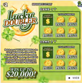
Name: LUCKY DOUBLER Price Point: $2 Overall Odds: 4.47 Game #: 194