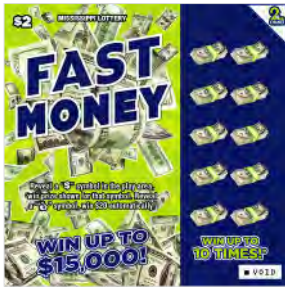
Name: Fast Money Price Point: $2 Overall Odds: 4.75 Game #: 109