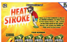
Name: HEAT STROKE Price Point: $2 Overall Odds: 4.65 Game #: 205