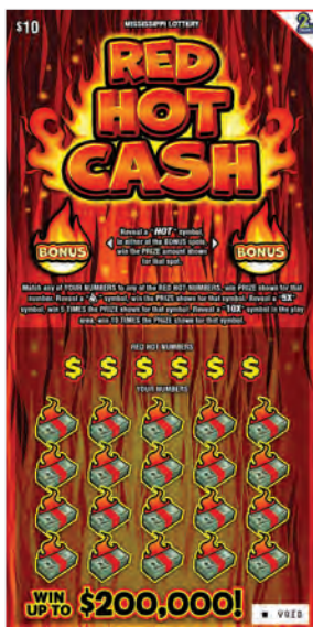
Name: RED HOT CASH Price Point: $10 Overall Odds: 4.07 Game #: 207