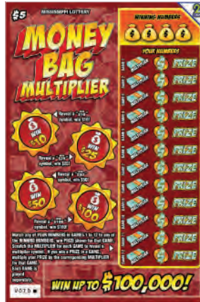
Name: MONEY BAG MULTIPLIER Price Point: $5 Overall Odds: 4.15 Game #: 150