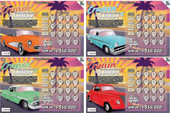
Name: CRUISIN' THE COAST II Price Point: $5 Overall Odds: 4.79 Game #: 146