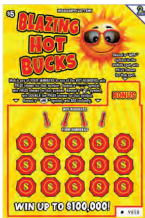
Name: BLAZING HOT BUCKS Price Point: $5 Overall Odds: 3.95 Game #: 206