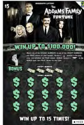
Name: The Addams Family Fortune Price Point: $5 Overall Odds: 4.03 Game #: 110