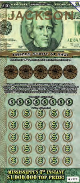
Name: JACKSON Price Point: $20 Overall Odds: 4.82 Game #: 151