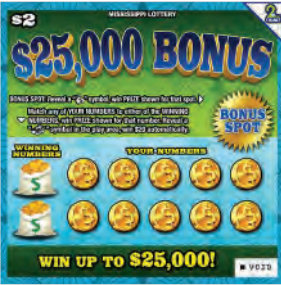
Name: $25,000 BONUS Price Point: $2 Overall Odds: 4.66 Game #: 149