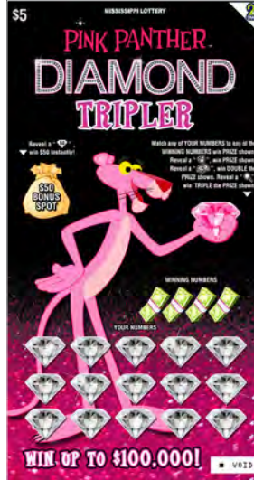
Name: PINK PANTHER™ DIAMOND TRIPLER Price Point: $5 Overall Odds: 4.26 Game #: 195